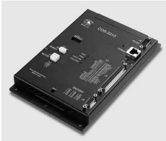
CDS-3310 Single-axis Controller and Drive System

The CDS-3310 incorporates a 32-bit microcomputer and provides such advanced features as PID compensation with velocity and acceleration feedforward, program memory with multitasking for simultaneously running up to eight programs, and uncommitted I/O for synchronizing motion with external events. Modes of motion include point-to-point positioning, jogging, contouring, and electronic gearing.